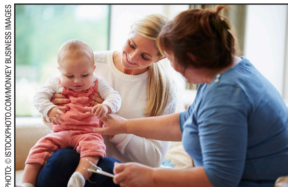
THE MATERNAL, INFANT, AND EARLY CHILDHOOD HOME VISITING PROGRAM: SMART INVESTMENTS BUILD STRONG SYSTEMS FOR YOUNG CHILDREN